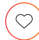
Charities and nonprofits