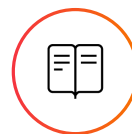
Premium publishers, news, and content